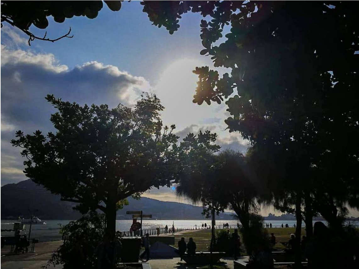
Taken by phone